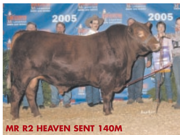
MR R2 HEAVEN SENT 140M

With the purchase of each female lot in the R2 Ranch Sale, October 8, 2005, buyers will receive two (2) units of semen on any Red Brangus or Red Angus reference sire indicated with an asterisk in the 2005 R2 Ranch Sale catalog reference sire listing on pages 28-31.