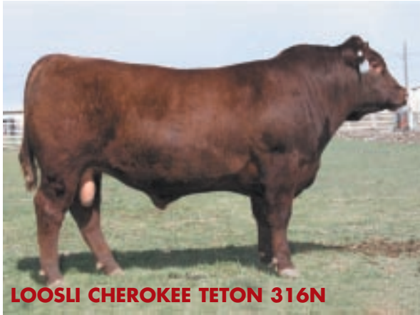
LOOSLI CHEROKEE TETON 316N