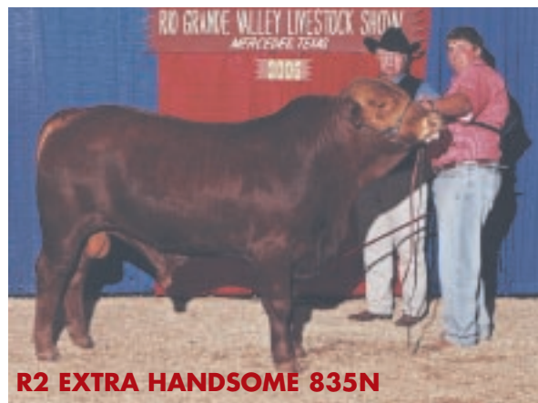
R2 EXTRA HANDSOME 835N