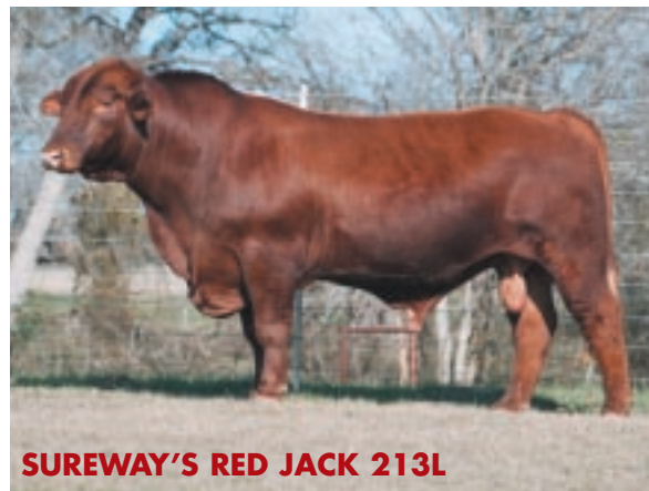
SUREWAY'S RED JACK 213L