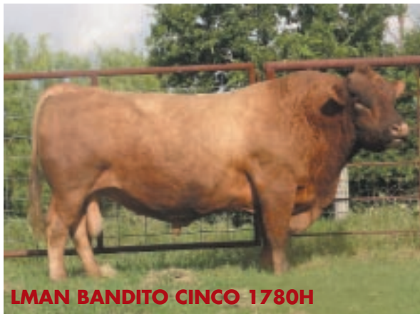
LMAN BANDITO CINCO 1780H