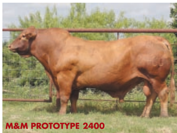
M&M PROTOTYPE 2400