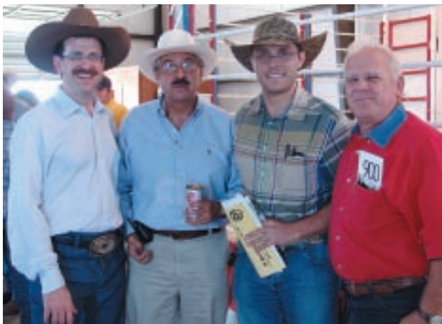
Columbian friends and R2 Ranch customers.