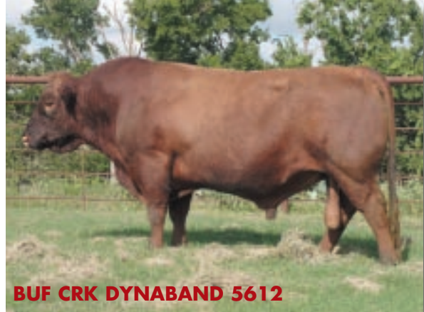
BUF CRK DYNABAND 5612