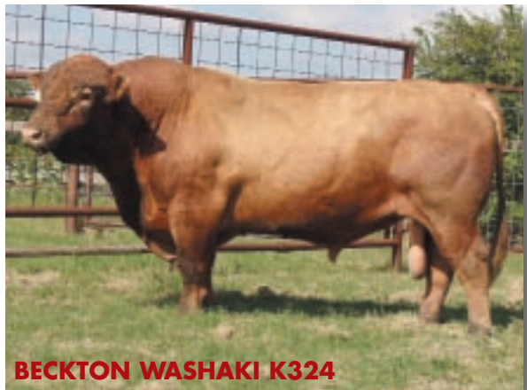
BECKTON WASHAKI K324