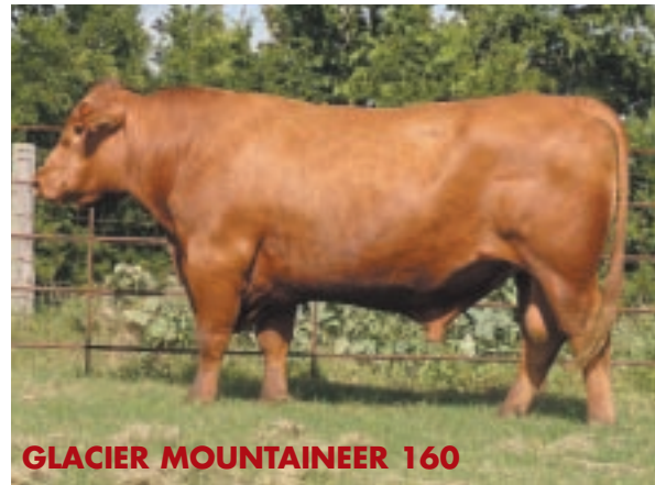
GLACIER MOUNTAINEER 160