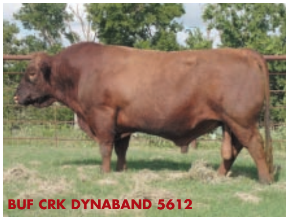
BUF CRK DYNABAND 5612